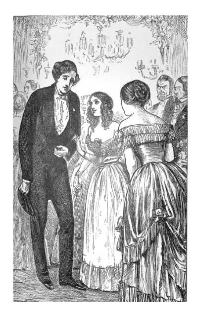
Fig. 2. Frontispiece. Henry James, Washington Square, 2

As a more accessible register, the visual images could have brought the audience closer to a specific interpretation of the text and thus fill the gaps that the text so carefully maintained, but this was not the case. The first full-page illustration is a good example since it introduced the main characters for the readers (see Fig. 2). The image seems to represent three people talking at a social event. The location is depicted in a few lines to suggest the size and ornamentation of the place, and the other people are drawn as a mere background. The three figures in the foreground, however, are rendered through detailed strokes in order to introduce the main characters visually. The gentleman is very formally dressed and his hat in his hand, his facial expression and slight bow all suggest that he is very respectfully greeting the woman facing him. The other woman, standing next to him, views him with a very open look and touches his arm trustfully. Her overall appearance, face, hair and dress suggest that she is very young and fashionable. However, the lady whom we see from the back is hardly introduced to the viewer. The details of her dress indicate her social status, her narrow waist reflects her age and her hairstyle suggests her preferences, yet not seeing her face takes away the possibility of the viewer to get to know this